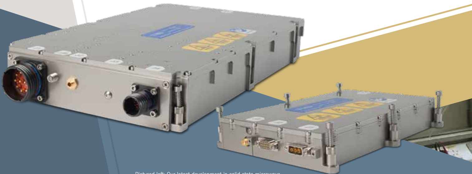
Pictured left: Our latest development in solid state microwave technology; the PTS6900 SSPA.

Our solid state units incorporate the latest advances in 0.25 \mu\text{m} GaN MMIC technology and low loss power combiners; optimised for EW applications.